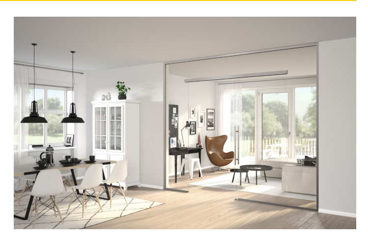
FRAMELESS GLASS DOORS INCL. PATCH FITTINGS, SLIDING DOORS & HARDWARE