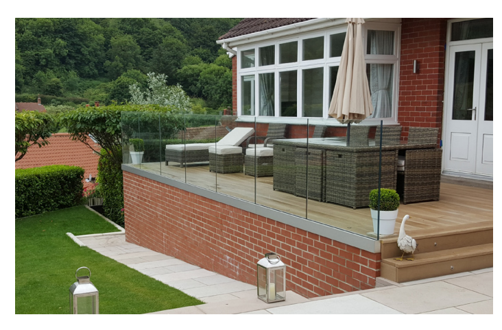
RESIDENTIAL BALUSTRADES FRAMELESS GLASS, STAINLESS STEEL POSTS, SPIGOTS & WIRE SYSTEMS