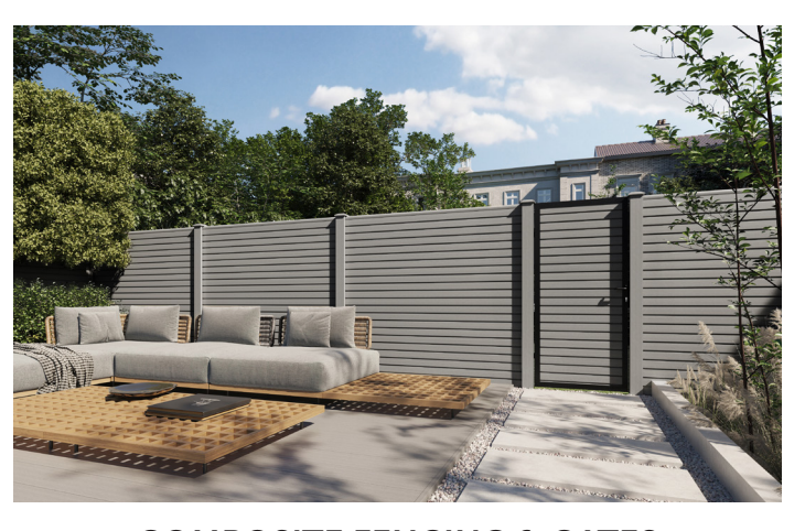
COMPOSITE FENCING & GATES HIGH STRENGTH, MODULAR, LOW MAINTENANCE