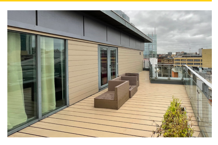
A2 FIRE-RATED ALUMINIUM DECKING & FIBRE CEMENT CLADDING