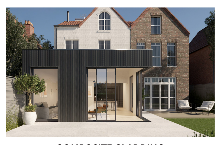
COMPOSITE CLADDING SLATTED & PANEL STYLES