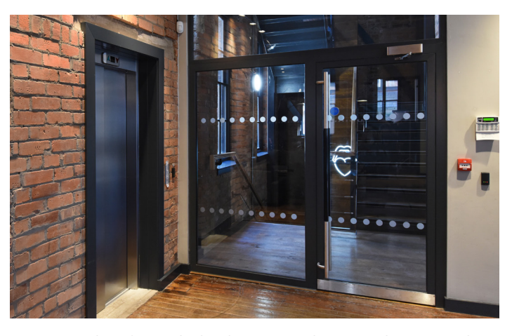
FIRE, SMOKE & SECURITY STEEL GLAZING DOORS, WINDOWS, CURTAIN WALLING & PARTITIONS