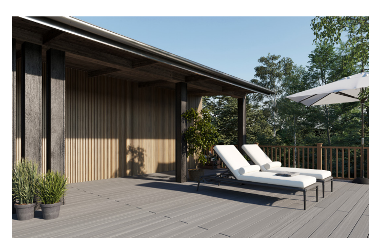
COMPOSITE DECKING WOOD EFFECT, ANTI-SLIP, RECYCLED MATERIAL