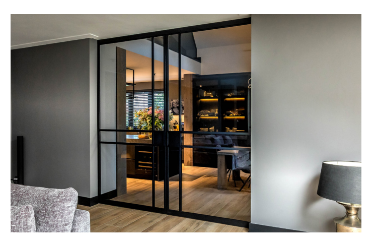
SLIMLINE STEEL WINDOWS & DOORS HIGH THERMAL PERFORMANCE